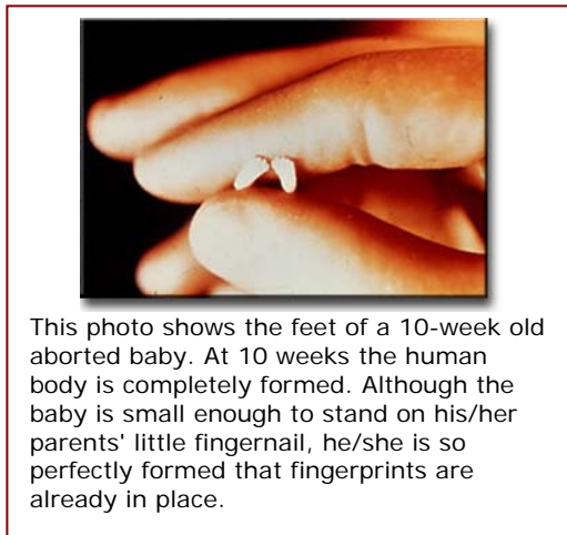
This photo shows the feet of a 10-week old aborted baby. At 10 weeks the human body is completely formed. Although the baby is small enough to stand on his/her parents' little fingernail, he/she is so perfectly formed that fingerprints are already in place.