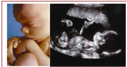
Week 22: My grandbaby is now 22 weeks gestation and we know he is a boy! At this stage he can dream and is recognizing his mother's voice. A fine hair called lanugo covers his body. Sex organs become more obvious. He now has fingernails. Eyebrows and eyelids are now in place. He is now a little more than 10 inches long if you stretched out his legs and he weighs about 12 ounces. He 'drinks' amniotic fluid and feels pain. His mother has begun to feel his movement inside her.